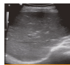
Healthy liver (normal echogenicity)

80% of patients with normal liver enzymes could be diagnosed with ultrasound