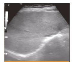
Steatotic LIVER (increased echogenicity)

Accumulation of fats in the liver causes steatosis, which shows as increased echogenicity on ultrasound